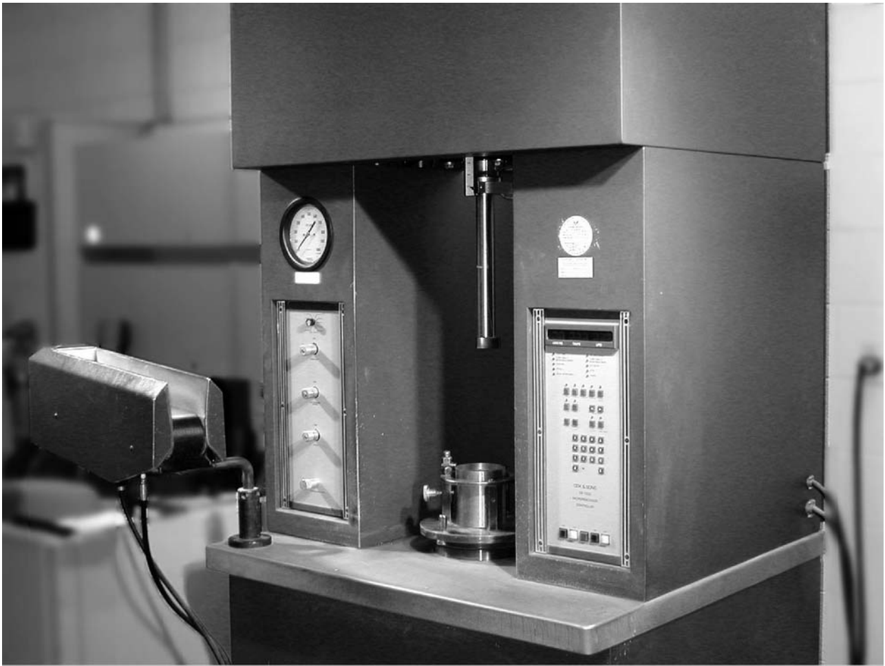
FIG. 2 Compactor with Sample Feed Trough

5.12 Proving Lever Assembly , as shown in Fig. 8 and Fig. 9. 5